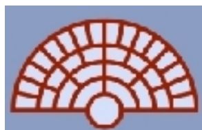
The Genealogical Society of Pennsylvania